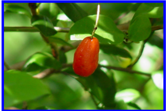
Simpson Stopper fruit, photo from the internet

Normally a small tree of 20-30', this member of the Myrtle family, Myrcianthes fragrans , has peeling bark, small aromatic leaves as well as flowers and fruit that attract birds, bees and butterflies. The shape, style, size and care of this particular tree attracts bonsai enthusiasts. pl